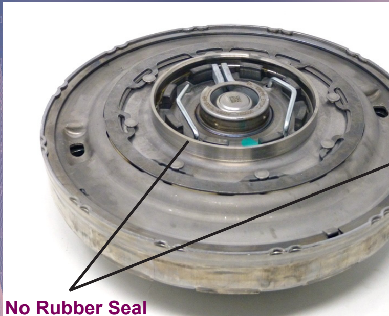
No Rubber Seal