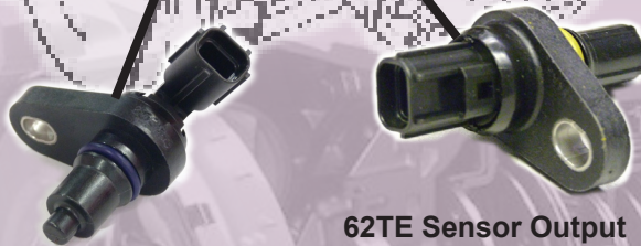
62TE Sensor Output Part No. 72.SW.09