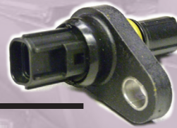
62TE Sensor Input Part No. 72.SW.09