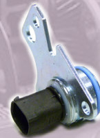
62TE Switch Pressure Transducer Part No. 72.SW.11 (Located on Valve body)