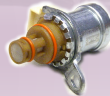
62TE Solenoid-Pressure Regulator (EPC) Part No. 72.SW.12 (Located on Valve body)